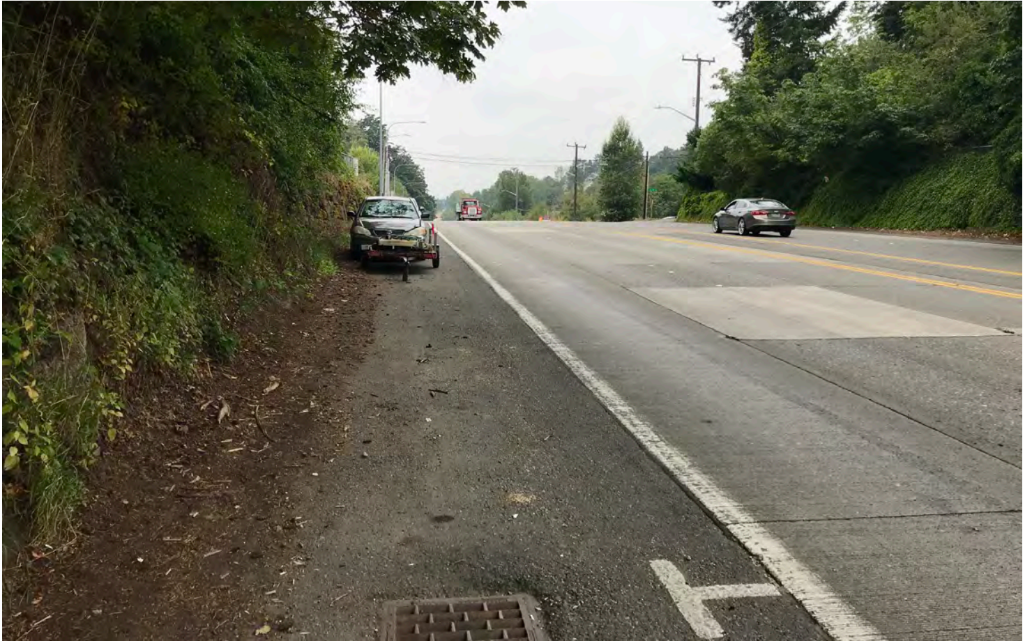
Jidka aadka loo maro ee SR 900 waxa uu leeyahay jid yar oo cagta ah oo ma laha qaababka kale ee amaanka.

Macluumaadka Xeerka Naafanimada Ameerikaanka (Americans with Disabilities Act, ADA): Codsiyada guryaha dadka curyaaminta ah waxaa lagu sameyn karaa iyada oo lagala xariirayo kooxda WSDOT Diversity/ADA Affairs emailka ah wsdotada@wsdot.wa.gov ama iyada oo lagala hadlayo taleefanka bilaashka ah ee, 855-362-4ADA (4232). Shaqsiyaadka dhagaha la' ama dhagaha culus waxay samayn karaan codsi iyagoo wacaya War laliska Gobolka Washington ee 711.