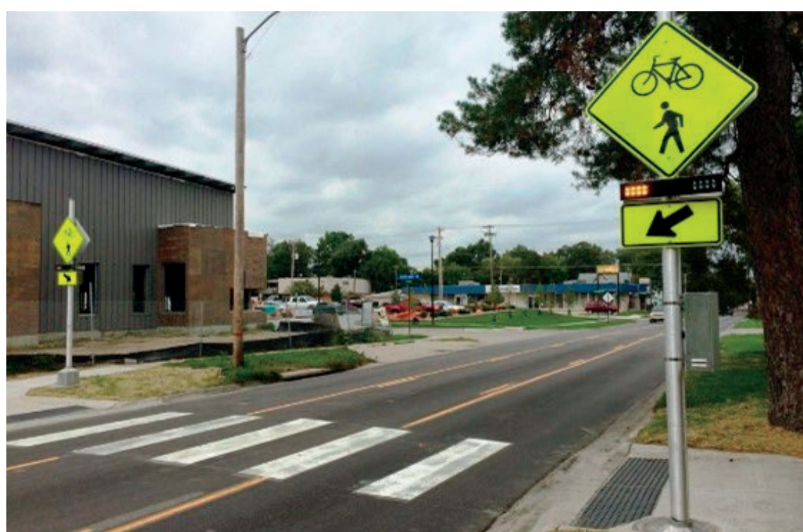
Example of a RRFB