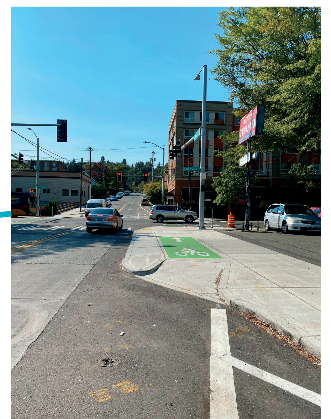
Bulb-out with bike ramp

Conceptual layout of a midblock crossing with bulb-outs with bike ramps by Safeway. Additional bulb-outs can be placed to deter passing on the right in the buffered bike lane.