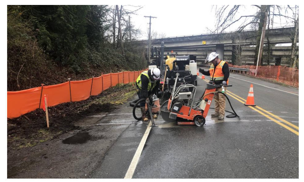
Crews performing saw cutting work on Woodinville Dr.